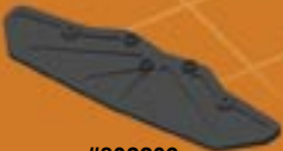
#802209 Lola bumper (coming soon)