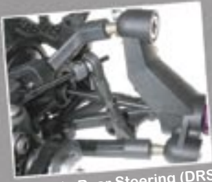
Dynamic Rear Steering (DRS)

Completely new, the Serpent designers have started from a blank screen in order to create this all new 200mm. Called the Serpent (Seven Ten), it represents nearly 2 years of intensive development & testing and sets new standards in performance, durability, ease of use and ease of assembly.