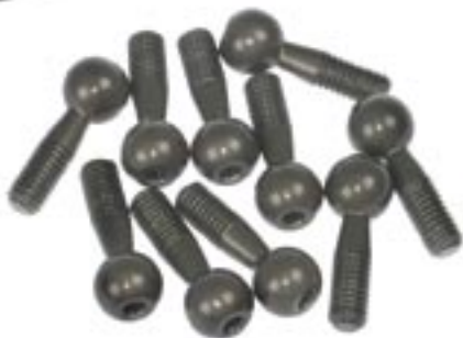
Ultra lightweight aluminum pivot balls standard