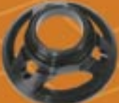
#802502 Centax-III clutch housing open (coming soon)