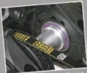
Adjustable front and rear belt-tension