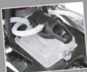
75cc fuel tank with AFL lid