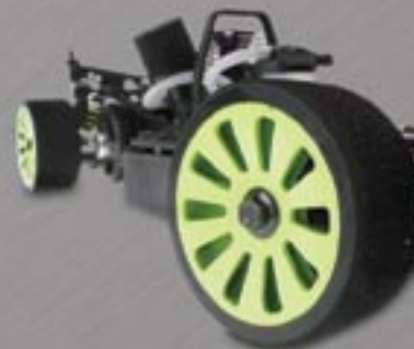
Laid down steering servo with centrally mounted, ball-raced servo saver