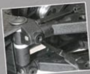
Adjustable front roll center (ARC)