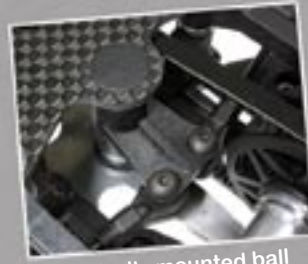
Centrally mounted ball raced servo saver