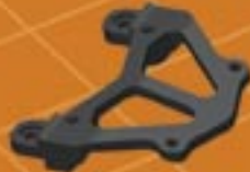
#802208 Lola bumper plate (coming soon)