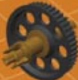
#802390 Solid rear axle (coming soon)