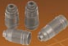
#909410/11 Shock body alu. teflon front/rear