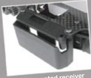
Side mounted receiver with protective cover