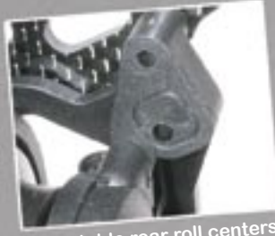
Adjustable rear roll centers (ARC)