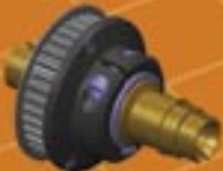
#802376 Front adjustable ball differential (coming soon)