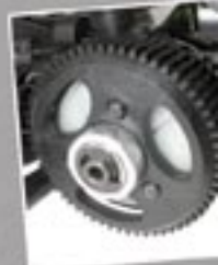
Low inertia 2-Speed Graphite chassis

Advanced design for quick-change of both the front and rear main axles